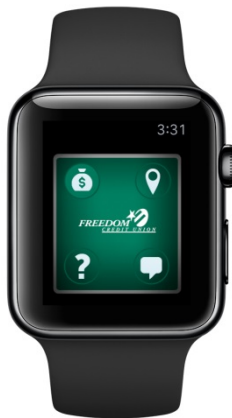
Apple Watch Screen Shot